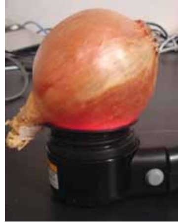
Fig. 3 The measurement of the NIR spectrum of an onion using the K-BA100R spectrophotometer. The onion is being illuminated with the NIR beam.

Following the optical measurements, each onion was cut vertically, and browning symptoms inside the area irradiated by the NIR beam was visually scored as 0 (sound, with no signs of browning) or 0.1 (with browning of the inner scales) and the cut surface was digitized (CanoScan 8600F, Canon, Tokyo, Japan).