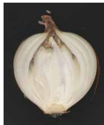
Fig. 1 Browning of the inner scales of the onion 'Momiji 3' ( shingusare in Japanese). The browning symptoms occurred in the second to sixth scales from the outside.

We obtained 'Momiji 3' onions from Japan's Hyogo Prefecture. We also obtained onions (of an unknown cultivar) grown in Hokkaido Prefecture from a merchant. Previous testing revealed that onions should be stored at a range of temperatures to facilitate analysis (Ito and Morimoto, 2007). We therefore stored samples at 7 °C in a refrigerator (hereafter, the low-