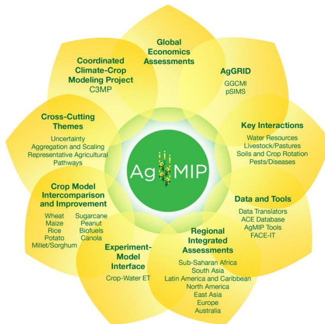
Fig. 2. Current AgMIP activities

Fig. 2 shows the range of projects that are currently underway in AgMIP. We comment specifically on three petals of that diagram.