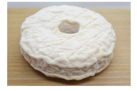
Fig.2 Koji cheese aged with koji mold and sake lees

A dedicated manufacturing facility was created in June 2020, and after many prototypes, the cheese was finally