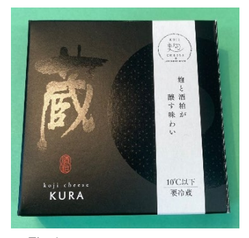
Fig.1 Package containing "Koji Cheese KURA"

is characterized by its unique flavor created by koji and sake lees. It goes well with Japanese sake, making it possible to enjoy a traditional "Japanese" flavor. Led by Nippon Veterinary and Life Science University, a consortium of seven institutions including Zao Dairy Center, Higuchi Matsunosuke Shoten Co., Ltd., and the National Agriculture and Food Research Organization has been established, and the cheese is a major result of promotion of joint research through industry-academia collaboration. By mixing with sake lees from local sake breweries, it is possible to make local koji cheese that is unique to that area, and therefore it can be expected to revitalize the area with specialty products.