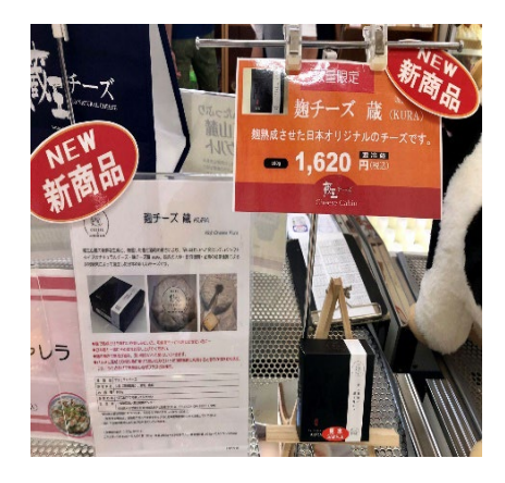
Fig.3 Zao Dairy Center direct sales shop

While soft white mold cheese such as Camembert takes 3 to 4 weeks to mature, koji cheese matures for only about 10 days, ensuring high production efficiency and high profitability. Since there is no cheese using koji mold in other countries, it is possible to differentiate it from imported cheese, and it also has the strength of having little risk of being involved in price competition.