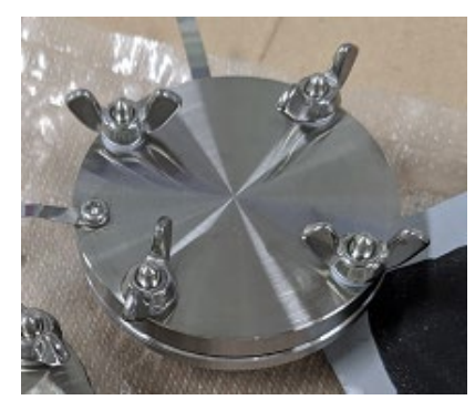
Photo 3: Electrode materials using nanomaterials

Supercapacitors are already used for regenerative brakes in automobiles as a device to recover and charge the energy during deceleration utilizing the motor as a