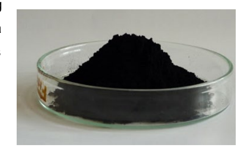
Photo 2: Nanomaterial for electrode that increases the electricity storage capacity

Furthermore, the company has succeeded in developing an electrode material using its own "dispersion technology," which is the process technology to mix CNTs to other materials uniformly and maximize its characteristics. As a result, they achieved a capacity