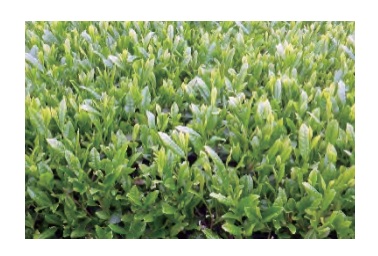
'Kiyoka' Cultivar registration at 2020. Floral Fragrance Tea cultivar.