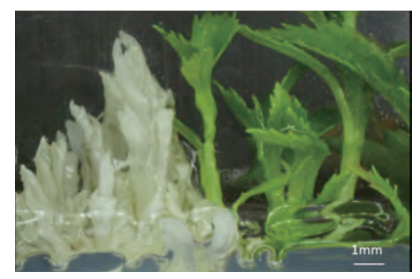
Development of genome editing techniques of fruit trees