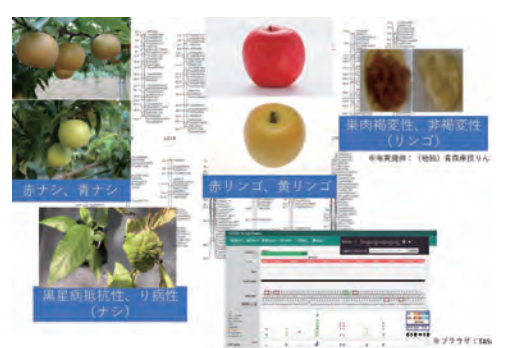
Development of linkage maps and DNA markers linked with important agronomic traits

The Division of Fruit Tree Breeding Research is pursuing research on the development of high-quality and easy-to-cultivate cultivars of deciduous fruit trees and the development of new breeding materials. Recently, we are developing new deciduous fruit cultivars that are delicious, easy-to-eat, and easy-to-cultivate such as the superior-colored apple cultivar 'Kinshu,' the Japanese pear cultivar 'Kanta' with high sugar content, the Japanese chestnut cultivar 'Porotan' which pellicle is easy-to-peel after heating, the peach cultivar 'Sakuhime' that is highly expected to flower and ripen stably even when the winter temperature continues to increase due to global warming, the superior-colored grape cultivar 'Grosz Krone,' and the pollination constant non-astringent type persimmon cultivars 'Reigyoku' and 'Taiga' that enable stable production of seedless fruits. To improve the accuracy and efficiency of fruit tree and tea breeding, we are working on developing genome information databases, data-driven breeding system, and genome editing techniques. To date, we have resequenced the apple cultivar 'Fuji' and performed whole-genome sequencing of the grape cultivar 'Shine Muscat'. We have developed high-precision markers related to apple leaf spot disease resistance and chestnut easy-peeling pellicle. We have also successfully produced genome-edited plants for apples and grapes.