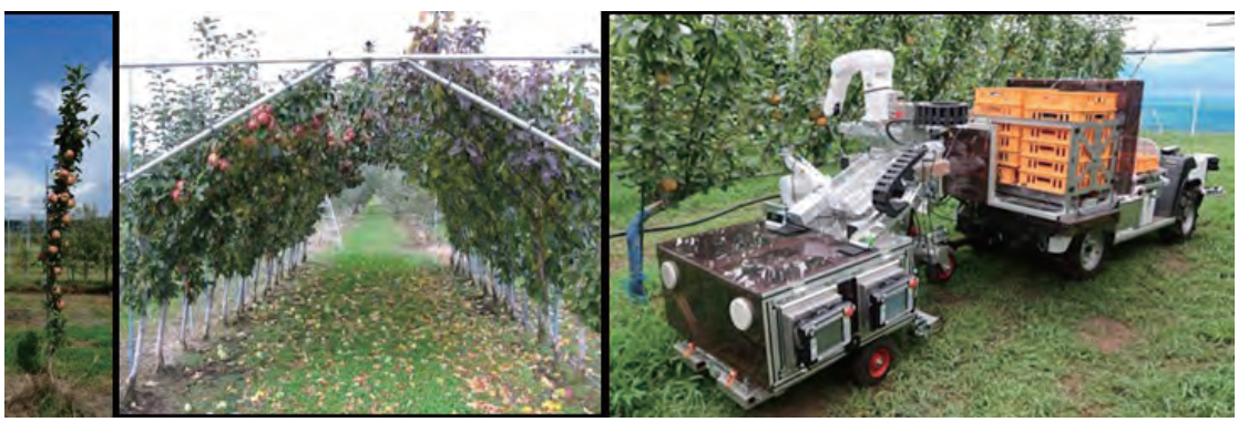
Integration of labor-saving suitable varieties and cultivation technologies and development of labor-saving production technologies

In the fruit industry of Japan, it is expected that the domestic market will shrink due to the loss of interest in fruit among young people and the increase in fruit prices. Furthermore, in the future, domestic fruit production bases may become weaker and production volume may decline due to an increasing shortage of labor at production sites and the impact of global warming. In response to this situation, we should aim at achieving a stable supply of high-quality fruit at reasonable prices by saving labor and improving productivity through data-driven cultivation management while responding to the ongoing global warming. To expand domestic and overseas demand and strengthen production bases in domestic production areas, we are working in cooperation with external organizations to conduct research from cultivation to distribution.