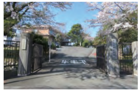
Kanaya Tea Industry Research Center

The Division of Tea Research has two research stations. The Kanaya tea research station is located in Shizuoka Prefecture, and the Makurazaki tea research station is located in Kagoshima Prefecture. We are conducting studies on breeding, agronomy, farm management, tea processing/manufacturing, quality evaluation, and utilization of health benefit components. The Kanaya tea research station is developing new tea production technologies by researchers with diverse expertise. The Makurazaki tea research station is developing tea cultivars in warm climates and holds a large number of accessions to tea genetic resources from both domestic and overseas. During this 5-year research period, we are working on two major research projects. The first is to breed cultivars containing health benefit ingredients and develop technologies for utilization of health benefit ingredients to expand the demand for tea, and the second is to develop labor-saving and smart production technology contributing to improving the productivity of tea producers who are expanding their management scale.