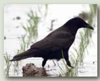
A carrion crow walking in rice paddy