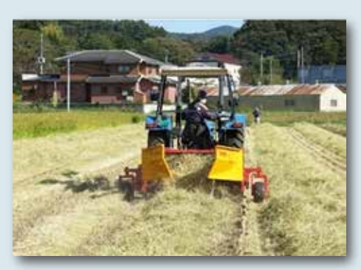
Reversing windrow for drying using a swath conditioner