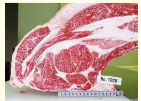
Cross section of dressed carcass from a castrated Japanese black bull fattened with mixed diet using forage rice