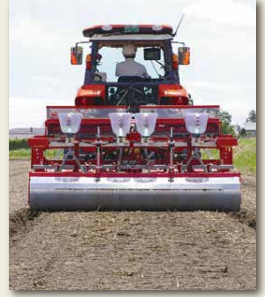
A high-speed rotary-tilling and ridge-making seeder

We develop plant protection techniques and strategies to control important insect pests and diseases of crops in the Hokuriku region.