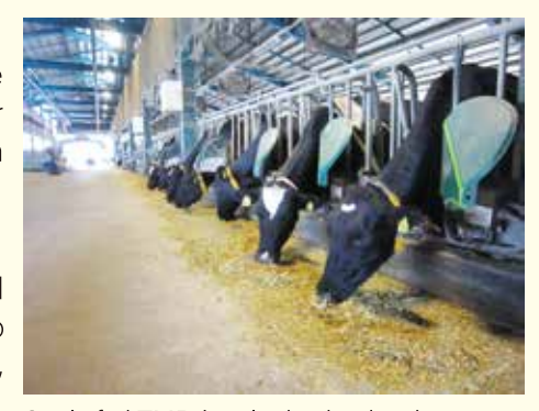
Cattle fed TMR (total mixed rations)

In order to improve and stabilize profitability of livestock farms management through expansion of production and use of domestically produced feed, we are pursuing research on business analysis, economic evaluation of emerging technologies and collaboration of cultivation and livestock.