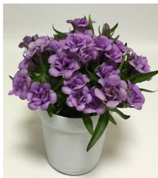
Photo 3: Ashiro Bouquet Rosé