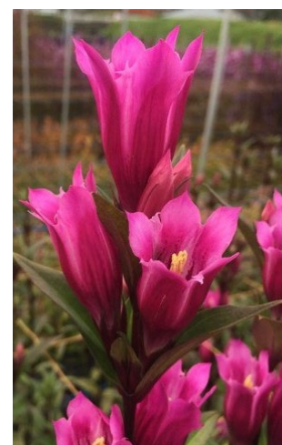
Photo 6 Red gentian under development

Along with the development of double-flowered gentians, the creation of a red variety has also been pursued. The original color of gentians is blue-purple. Until now, there have been varieties of flowers in pink and whitish colors using natural mutations, but there were no red-flowered varieties in Japan. The group led by the Hachimantai City Floricultural Research and Development Center repeatedly crossbred red varieties imported from New Zealand with Japanese gentians to create a red line (Photo 6). In the breeding of this red line, the Iwate Biotechnology Research Center and its partners were the first in the world to successfully identify the genes involved in producing a more vivid red color, and used breeding efficiency technology based on the identification marker developed based on it. This vivid red line of gentians is not yet ready for market, but development of the variety is ongoing. Dr. Masahiro Nishihara, head of Department of Horticultural Sciences at the Iwate Biotechnology Research Center, who is in charge of overall research and development, says passionately, "Gentians still have great potential for development. In the future, we want to develop varieties with new traits to further expand demand."