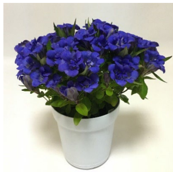
Photo 2: Ashiro Bouquet Marine

Iwate Prefecture is the largest producer of gentians in Japan, accounting for about 60% of the country's shipments. To further expand the opportunities for gentians to be used, there was a strong desire to develop new and novel varieties. The Hachimantai City Floricultural Research and Development Center, located in the main production area of gentians, and its partners have been working on improving varieties with the aim of developing "double-layered" and "red-colored" gentians for the past six years. There have been double-layered gentians born from natural mutations in the past, but their shape and appearance were poor, with spots on their petals, making it difficult to use them as suitable varieties for the purpose. Therefore, by repeatedly crossing with other gentian breeding lines, seven attractive double-layered varieties were finally created. From among these, gentian producers in the Ashiro area of Hachimantai City shipped three potted varieties (Photos 2-4) for the first time in the fall of 2021. These colorful double-layered gentians have a long-lasting bloom and are popular as gifts or for viewing, and are gaining popularity as "Ashiro Bouquets". "Iwate Yae no Kagayaki Blue" is also a gentian born from this research.