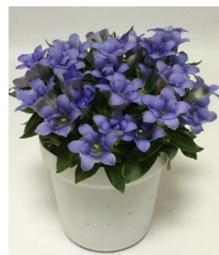
Photo 4: Ashiro Bouquet Aqua