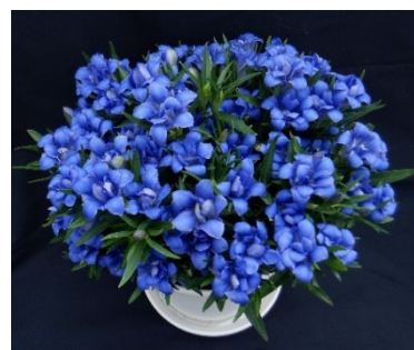
Photo 1 Iwate Yae no Kagayaki Blue double flower

In September of this year, a new gentian variety that never happened before debuts in Iwate Prefecture. Its name is "Iwate Yae no Kagayaki (Double-Layered Shining) Blue" (Photo 1). Developed by a research group led by the Iwate Agricultural Research Center, it is a double-layered gentian variety with petals that shine blue and overlap as they bloom. The name was chosen from among about 100 public entries. A naming ceremony was held in Morioka City to celebrate its grand launch.