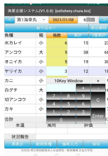
Figure 2: Entering fish catch data into Okisoko-kun (provided by Fisheries College)