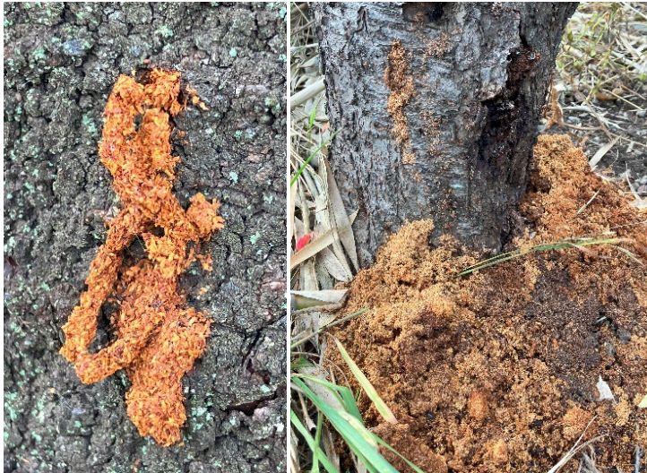
Photo 3: A row of frass pushed out from the excretory hole by the larvae of the red-necked longhorn beetle (left), a large amount of frass accumulated at the base of the tree (right)

It is important to regularly check the trunks and bases of cherry and peach trees for traces of frass. They can be seen from spring to autumn, but are found in many trees particularly during hot summer months, so if you check them only once a year, it would be most efficient to do it after the Obon holiday (a traditional Japanese holiday honoring the spirits of ancestors in mid-August).