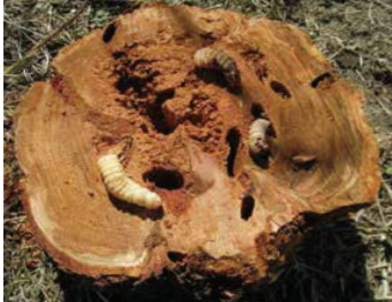
Photo 1: Larvae of the red-necked longhorn beetle hiding in the trunk of a dead peach tree. The hole in the trunk is a mark left by larvae.

The red-necked longhorn beetle is an invasive insect that damages Rosaceae trees such as cherry, peach, and plum. The larvae feed under the bark of the trees, causing them to wither and die in severe cases (Photo 1). A research group consisting of 11 institutions, led by the Forestry and Forest Products Research Institute, spent four years from 2018 studying the ecology, life cycle, effective pesticides, and control methods of the red-necked longhorn beetle, which was previously unknown in Japan. They compiled a manual on how to control the damage by taking appropriate measures at the right time. By utilizing this manual, it is expected that the beautiful scenery of cherry blossoms in spring, as well as fruit trees such as peach and plum, can be protected.