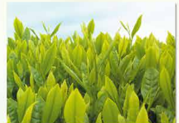
Relieving the symptoms of allergic rhinitis (Japanese cedar pollinosis) by drinking 'Benifuuki' green tea