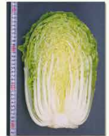
Development of a new Chinese cabbage F1 cultivar 'Akimeki' with high resistance to clubroot by using marker-assisted selection

We are challenging in the field of basic and applied researches to develop a long-term view for the future of the vegetable and tea industries and, eventually, for all of Japanese agriculture.