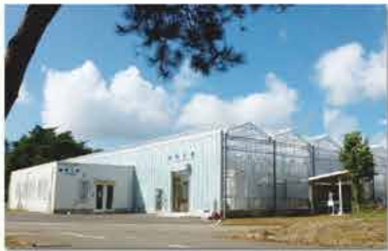
A large-scale greenhouse ( a "plant factory") that systematizes the use of advanced technologies

We are developing techniques to achieve a good balance between labor-saving, low-cost, stable production, and also reducing the environmental load.