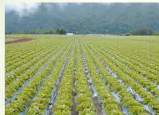
Development of low-cost and stable production systems for leaf and root vegetables