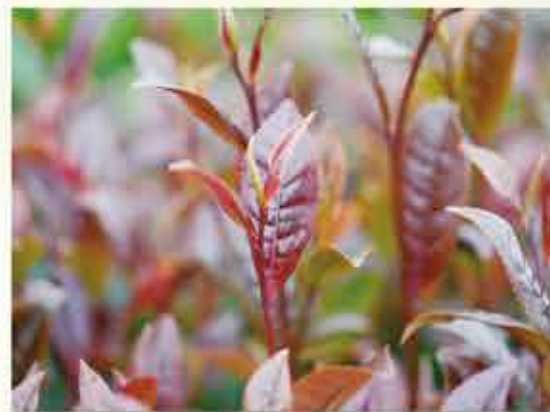
A new tea cultivar 'Sunrouge' with a high anthocyanin content