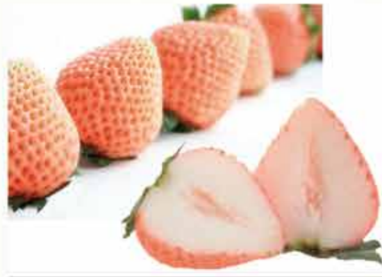
A new strawberry cultivar 'Tokun' with a rich aroma and a new taste

We are developing technologies to maximize the competitive superiority of domestic vegetables and tea by taking advantage of their diversity and characteristics as food materials.