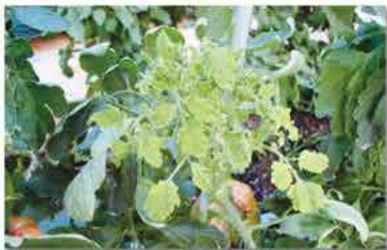
Creation of a manual for dealing with the Tomato yellow leaf curl virus