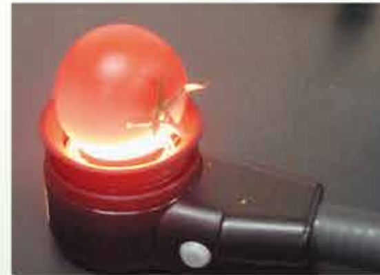
Non-destructive and precise estimation of tomato lycopene content

We are promoting practical research to solve the most important problems in vegetable and tea production, distribution, and consumption.