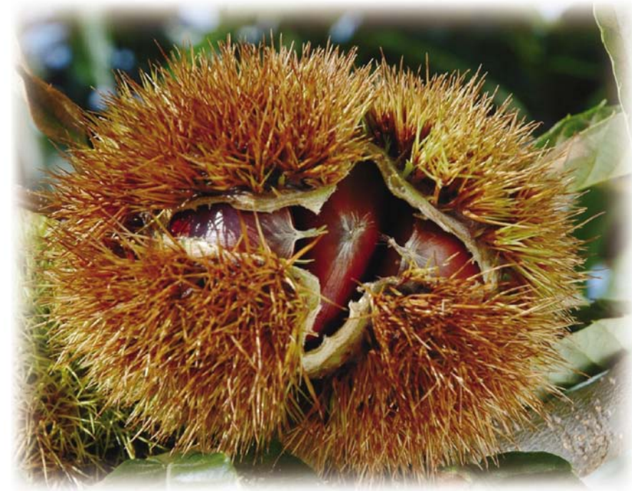
A new variety of Japanese chestnut, “ Porotan ”