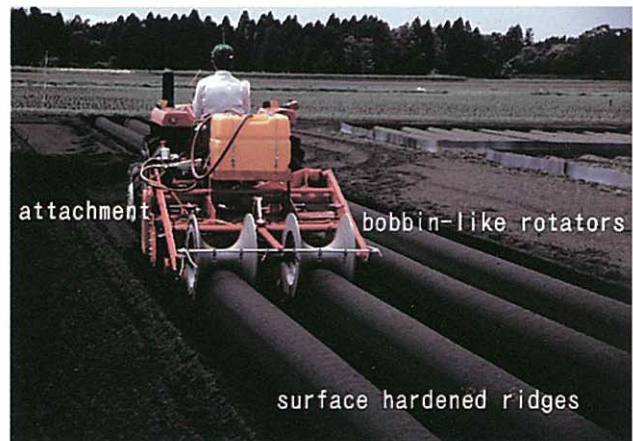
Fig. 1. Picture of hardening ridge surface by bobbin-like rotator

Crop management was easy, because to be formed same smooth surface ridges were formed by this method. There is also lower soil loss because of the hardened soil surface. Soil surface applied herbicides were also more effective, and fewer weeds germinate because brined seeds can't appeared hardened surface.