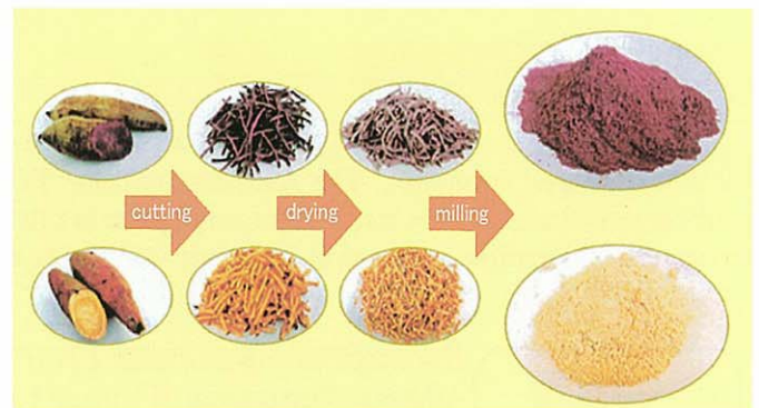
Fig. 2. Process of powder production from colored sweetpotato